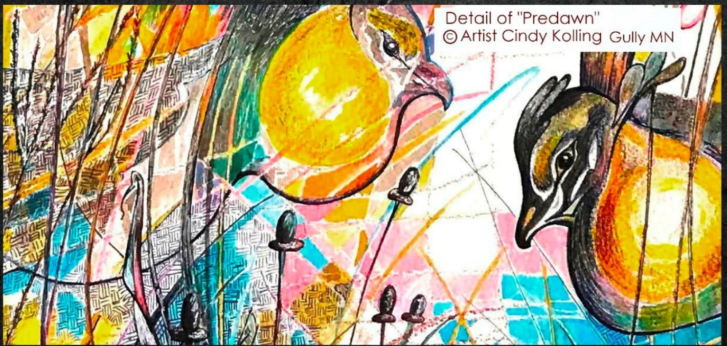
Detail of "Predawn" © Artist Cindy Kolling Gully MN